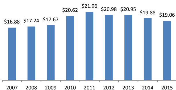
Yukon Tourism Industry, $ per hour, 2007 to 2015